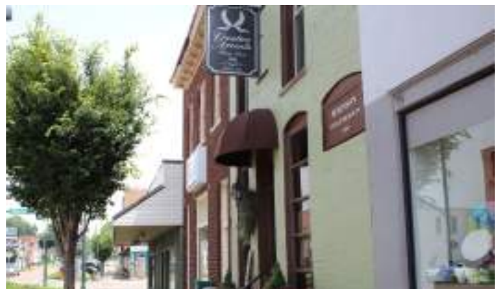
1316 Main Street

This building like the ones to the east and west were built in the mid 1880's. It replaced an earlier wooden structure that burned in 1881. Originally a drug store operated here until about 1900. A jewelry store, newspaper office, barber, and a racket store operated here between 1900 and 1915. A restaurant was in this location during the 1920's and 1930's. Stuarts Clothing Store and the Jack Ray Insurance Agency have also operated here.