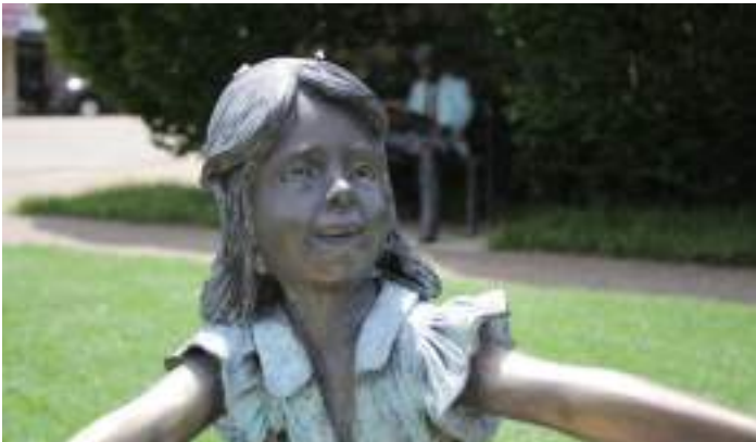
Mini Park (Central/Main)