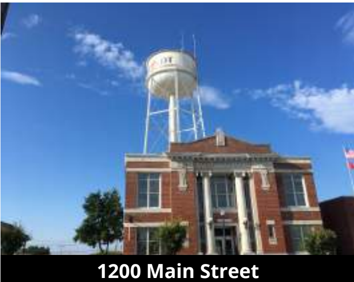
1200 Main Street

This building was built between 1891 and 1897 and has housed a variety of stores in its history. The exterior has only had minor changes made over the years such as a new door and windows. Some of the businesses that have claimed this as their home include a Racket Store, a Pool Room and Dry Goods store. One of the most interesting uses this building had was in 1905 - there was a Carriage Repository (buggy storage) on the 1st floor and a photo studio on the 2nd floor.