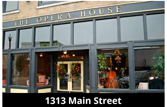
1313 Main Street